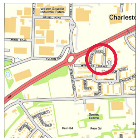
Contains Ordnance Survey data © Crown copyright and database 2017